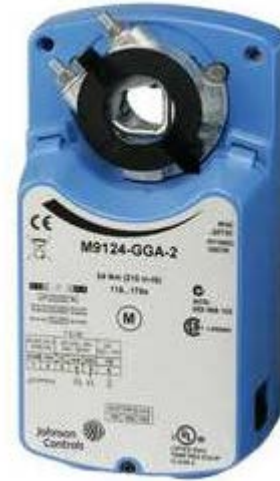
Figure 1: M91xx Series Actuator

A single M91xx model delivers up to 280 lb-in (32 N·m) of torque. Two AGx, GGx, or HGx models in tandem deliver twice the torque or 560 lb-in (64 N·m). The angle of rotation is mechanically adjustable from 0 to 90° in 5-degree increments. Integral auxiliary switches are available to indicate end-stop position or to perform switching functions at any angle within the selected rotation range. Position feedback is available through switches, a potentiometer, or a 0 (2) to 10 VDC signal.